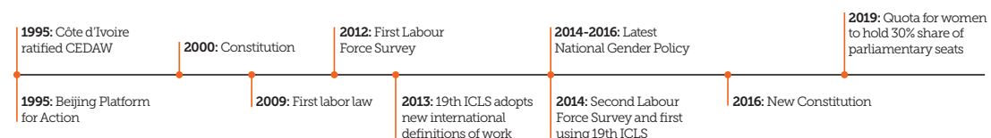
Figure 1. Timeline of milestones relevant to gender, development and measuring women’s work

The new conceptual framework for measuring work was introduced in Côte d’Ivoire in 2014, shortly after its adoption by the International Conference of Labour Statisticians in 2013. The process began in November 2013 with data collection beginning in February 2014. The questionnaire was designed to produce data using both the new and old definitions of employment to support transition and explain the break in series. Côte d’Ivoire benefited from the technical support of the ILO in the development of the questionnaire as well as the processing and analysis of the data and the redaction of the reports.